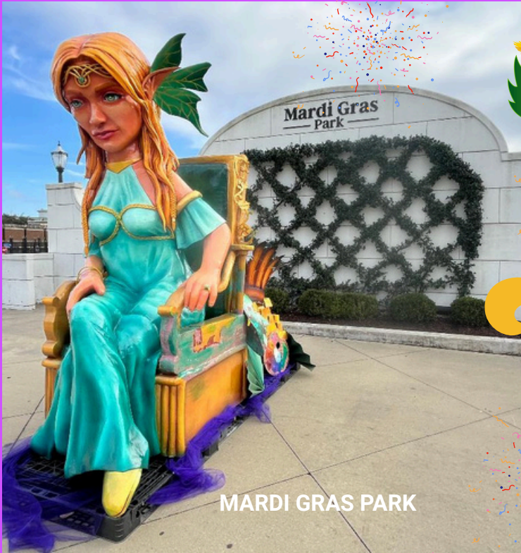
MARDI GRAS PARK

COME ENJOY BBQ AND ALL THE FIXINGS, KING CAKE, AND DRINKS