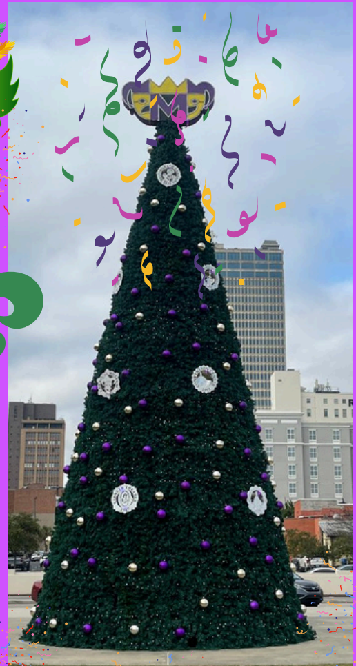
MARDI GRAS PARK